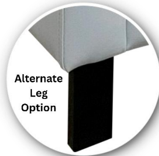
Alternate Leg Option